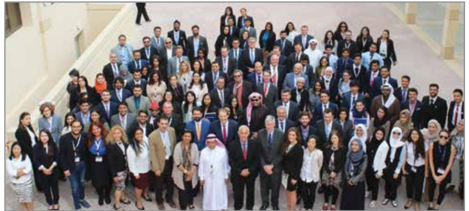
Participants in Bahrain Vis Pre-Moot and conference at the Royal University for Women

which time she taught an innovative cross-school course on European law, open to both undergraduates and Pitt Law students. ■