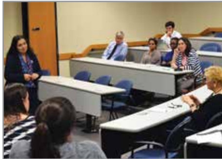
Vjosa Osmani (standing) answers audience questions.

On September 26, 2017, Dr. Vjosa Osmani (LLM '05, SJD 2015) spoke on "Transitioning Kosovo to the New Constitution and Democracy." Her perspective as a member of the Parliament of Kosovo, and former Chief of Staff and Legal Adviser to the President of Kosovo brought special insight to her presentation. She also taught a course on State Building and the Law: The Kosovo Experience in the fall term. (Osmani's career and accomplishments were the subject of an article in the 2017 Notes regarding Pitt's recognition of her work with the 2017 Sheth International Young Alumni Achievement Award.) ■