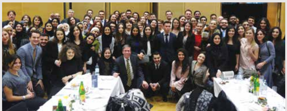
Pitt Consortium members at the final banquet in Vienna