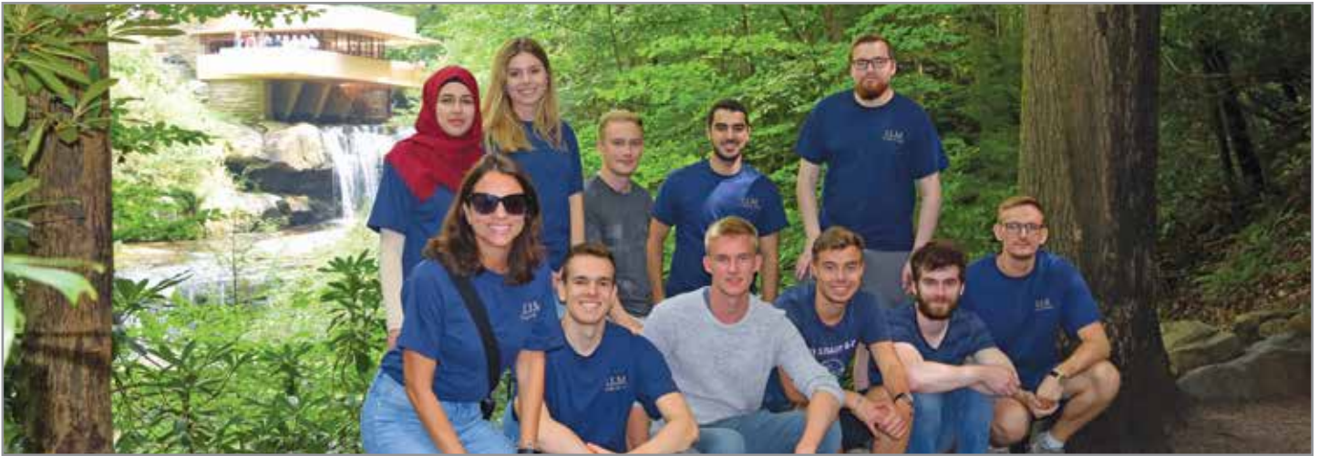
Several members of the Pitt Law LLM Class of 2019 at Fallingwater