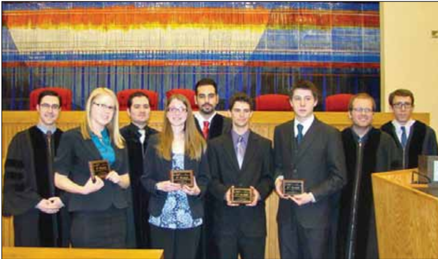
Pitt Law students served as judges for the 2 nd annual High School Moot ICC competition.