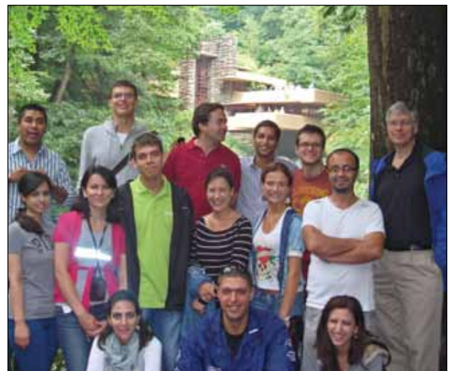
The 2012 LLM class visits Fallingwater