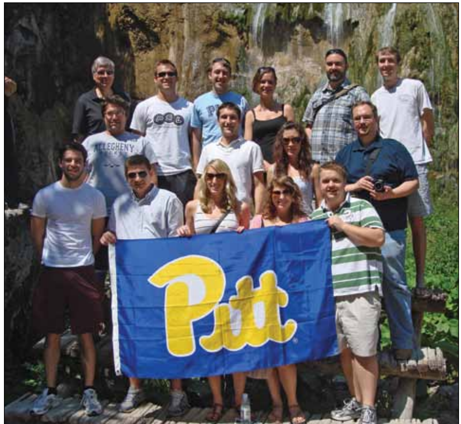
Pitt Law students during the second summer program in Croatia.