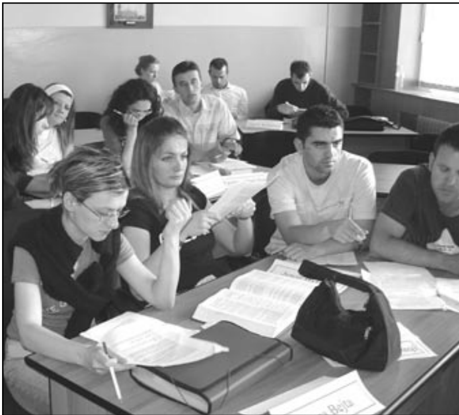
University of Prishtina students in class at the International Law Resource Center

The International Law Resource Center (ILRC) at the University of Prishtina Faculty of Law opened in May 2005 as a lasting element of the partnership between the Pitt and Prishtina law faculties. The ILRC benefits faculty and students conducting research in the fields of international and comparative law. The room, made permanently available by the administration of the Prishtina law faculty, was renovated and equipped through funds provided by the U.S. Department of State. Furniture, computers, and books were provided. Student volunteers now oversee the daily operational activities of the ILRC.